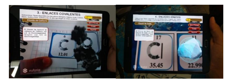
Fig. 3. Covalent bond example (left image) and Ionic bond (right image).

The second, third, and fourth exercises consist of the student forming a covalent bond, an ionic bond, or a metallic bond respectively. The student must collide two elements, through the use of markers required to solve the exercise. If the combination of the two elements is correct, information about the link is displayed and in turn, an animation with a physical appearance is displayed. The goal is to form 5 bonds. In the event of an error, a message is displayed indicating that the combination of elements does not form the compound of the requested link. Figure 3 shows an example of an exercise covalent bond and ionic bond.