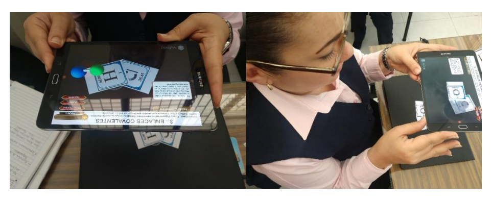
Fig. 4. Teachers interaction with ReAQ.